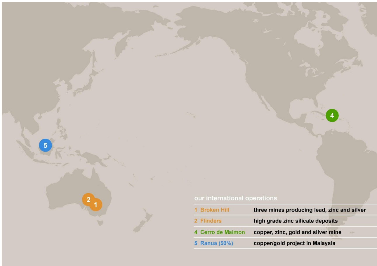
Map 1: Perilya’s international operations

Perilya continually reviews its largest spend areas at both its BH Operations and DR Operations.