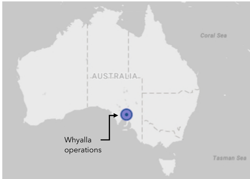
Figure 2 - Whyalla Operations