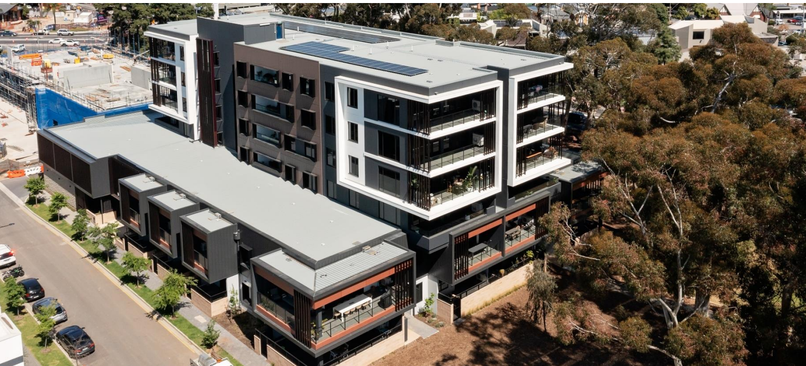
▲ Monarch Apartments, Glenside SA

The property development sector within Australia is not traditionally an industry exposed to risks of forced labour or human trafficking, and most of the company's suppliers are Australian-based, long term suppliers where the risk of modern slavery is low. All of the Company's material suppliers (determined by value of expenditure) are based in Australia.