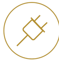
Electronics (including IT equipment and phones)