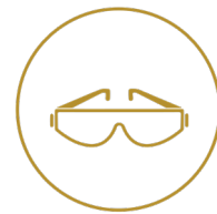
Uniforms and PPE