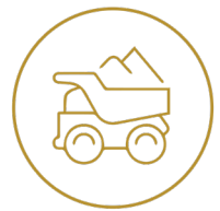
Plant & Equipment (including parts and tyres)

The Metarock Group engages with its approximately 750 Tier 1 suppliers through a mixture of short and long term arrangements which are reviewed regularly, and at least at renewal. The predominate procurement spend on Tier 1 suppliers is paid to Australian based entities. Following an assessment of our top 10 suppliers and our Tier 1 suppliers, we have identified that risks of modern slavery could exist within the following categories: