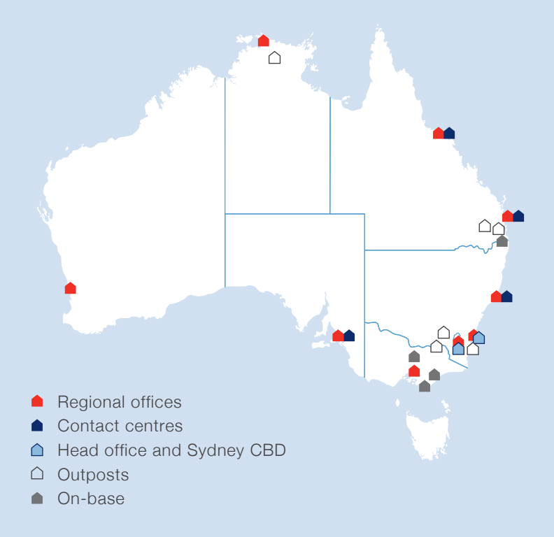
Figure 2 DHA office locations as at 30 June 2021

DHA maintains offices in capital cities, major regional centres and on select Australian Defence Force (ADF) bases and establishments around Australia. ADF members utilise Online Services to access a range of housing services including allocations, rent allowance and home maintenance. Staff in our regional offices deliver customer facing services to ADF members and their families. Regional office staff are supported by staff in our contact centres. DHA's head office is located in Canberra and provides operational, financial, information technology, human resources, communications and corporate support to the organisation.