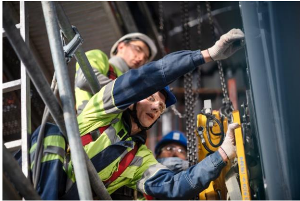
Risk Mitigation Program”).