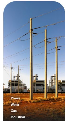
Power Water Gas Industrial

200+ km gas reticulation mains laid per annum