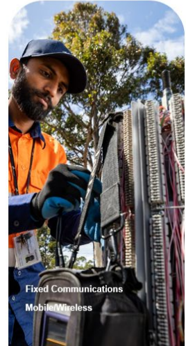
Fixed Communications Mobile/Wireless

50,000+ maintenance Network maintenance, remediation and relocations per annum