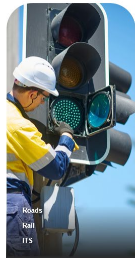
Roads Rail ITS

10,000+ ITS and Electrical devices maintained annually