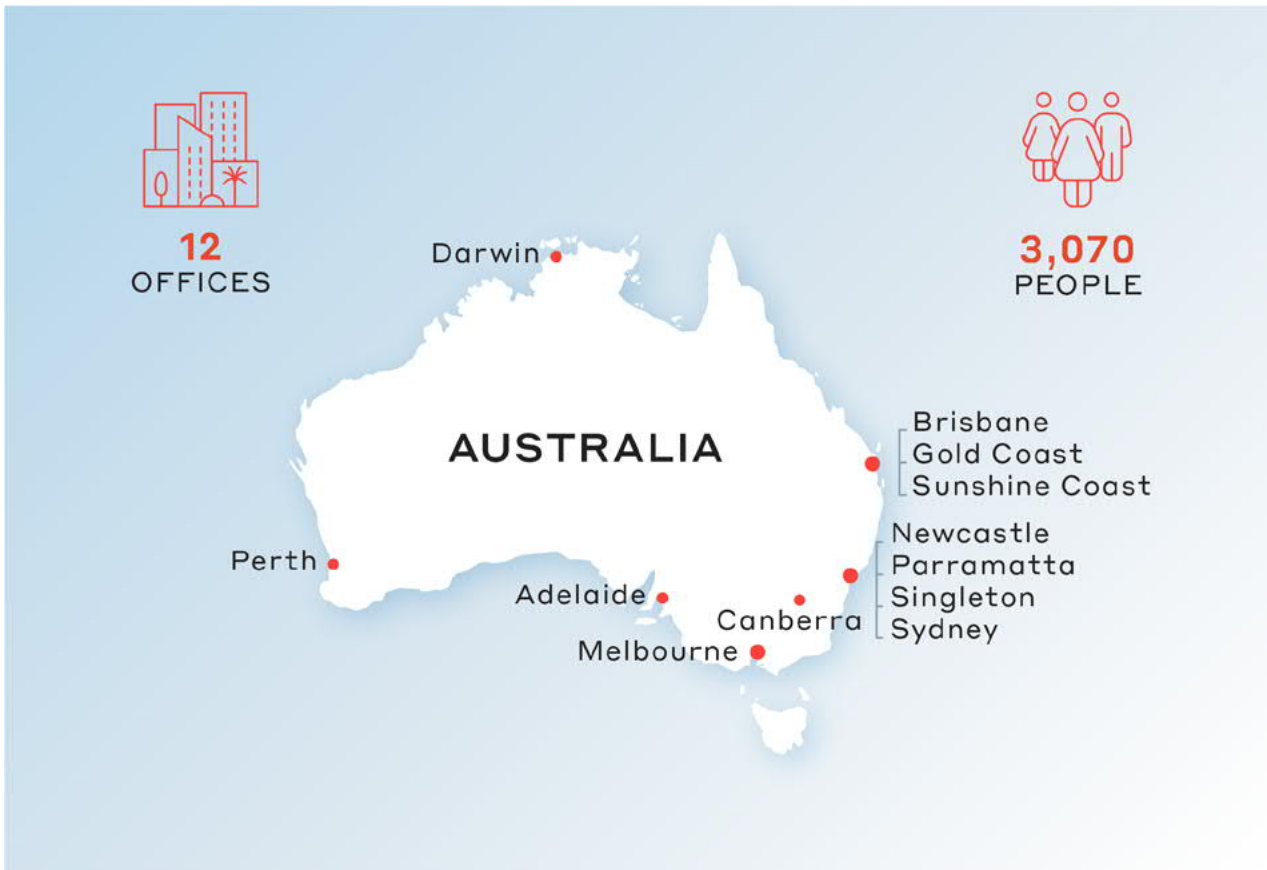
Pictured: Australian offices