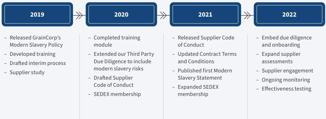
Figure 1: Four-Year Plan to establish Modern Slavery Risk Framework

GrainCorp’s 2021 Sustainability Report is available on GrainCorp’s website: graincorp.com.au