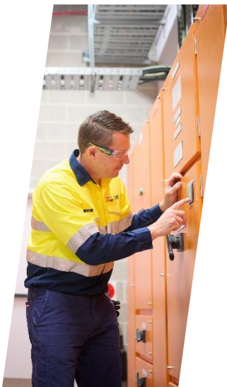
202,661 PPM Jobs Completed

City's field-based team members perform facilities management services at partner (customer) sites through-out all states and territories of Australia, including metro and regional locations.