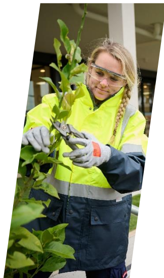
4,885 Partner Sites Serviced