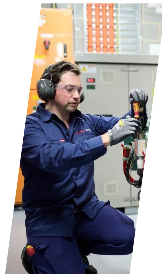
664,105 Reactive Jobs Completed