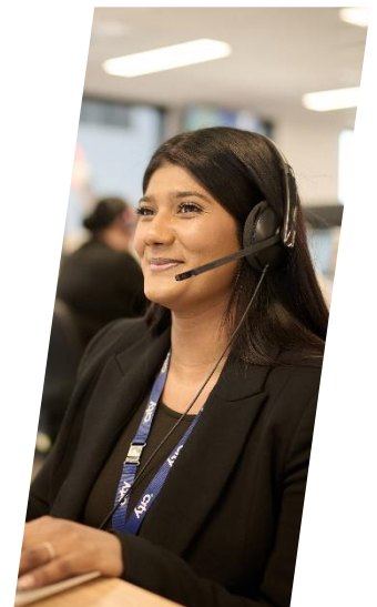
515,325 Calls Answered by Contact Centre