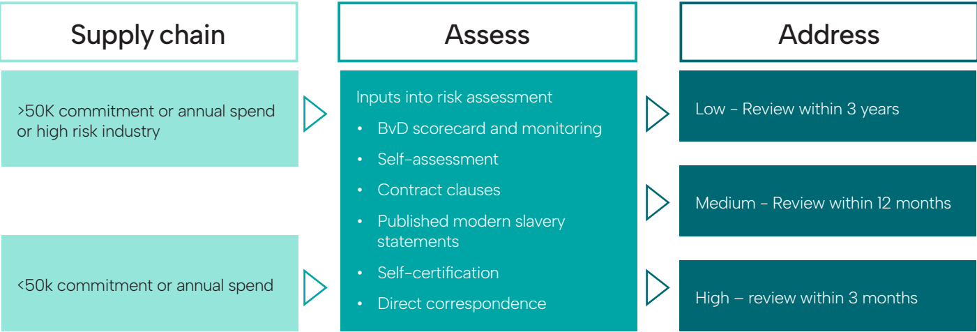
Figure 4: ASX approach to addressing modern slavery risk