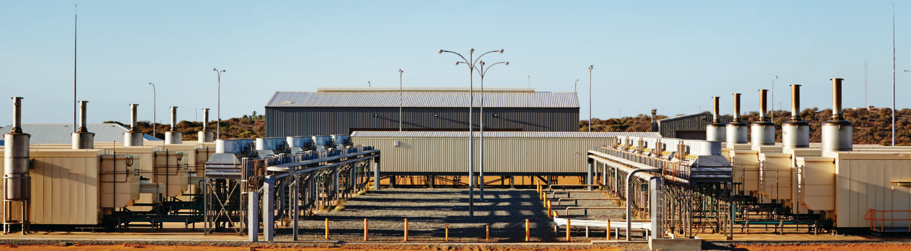
Location: Carnarvon, WA

As a regionally focused Western Australian entity, Horizon Power values its connection with key stakeholders through engaging with rural communities, working with and creating opportunities for Aboriginal people and protecting the environment.