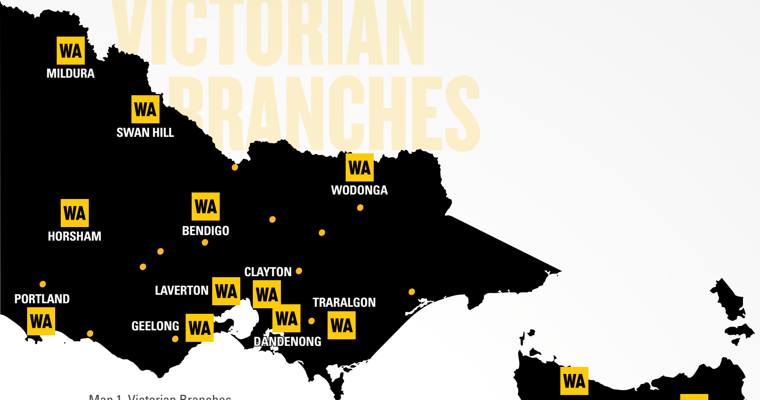
Map 1. Victorian Branches