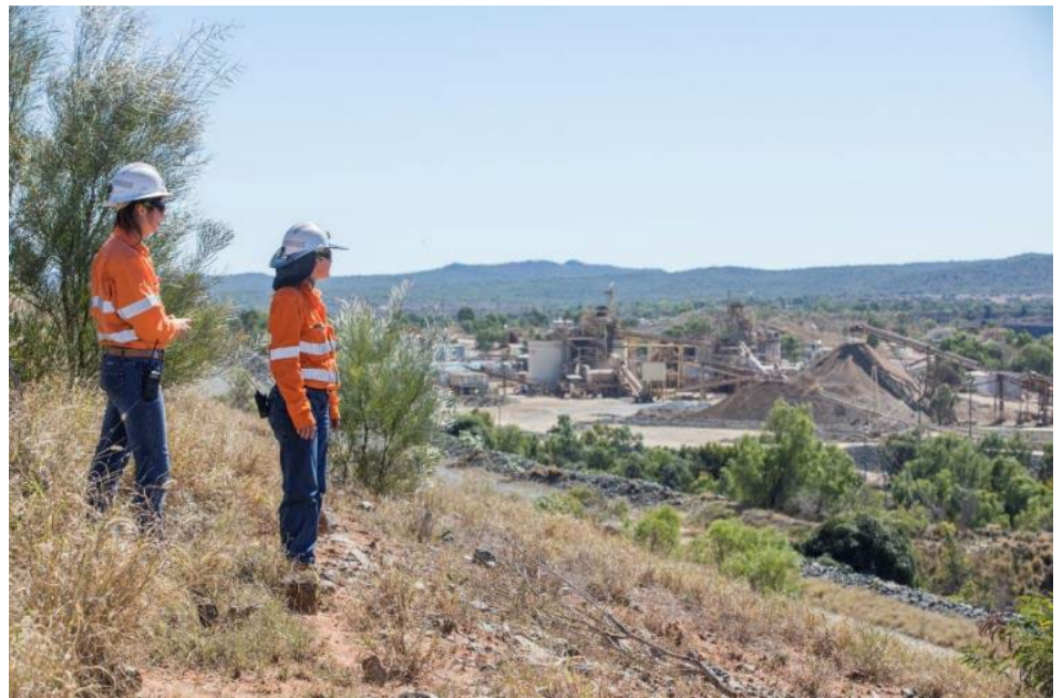
Figure 1 Overview of Processing Plant.

This joint Modern Slavery Statement ( Statement ) has been prepared by Ravenswood Gold Group Pty Ltd (ACN 637 523 712) ( Ravenswood Gold Group ) and covers the activities of Ravenswood Gold Group, Ravenswood Gold Holdings Pty Ltd (ACN 637 525 154) ( Ravenswood Gold Holdings ) and Ravenswood Gold Pty Ltd (ACN 637 527 309 / ABN 88 637 527 309) ( Ravenswood Gold ) (together, the Ravenswood Group ) for the calendar year 1 January 2023 to 31 December 2023.