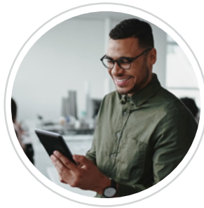
Technology and data management

The contractual arrangements we have with our suppliers vary due to the wide range of goods and services procured across the business. The main types identified are: