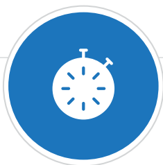
One-off, short-term procurement activities

The contractual arrangements we have with our suppliers vary due to the wide range of goods and services procured across the business. The main types identified are: