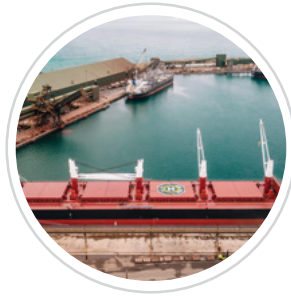
Industrial equipment and fleet