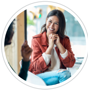
Business advisory services