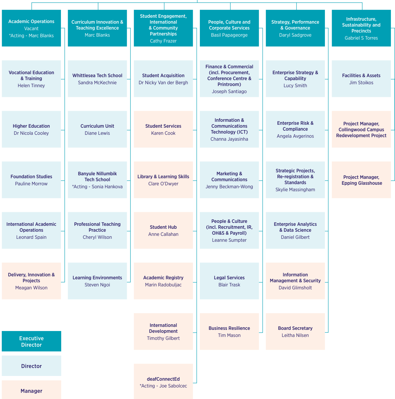
Organisational Chart Office of the Chief Executive 31 December 2021