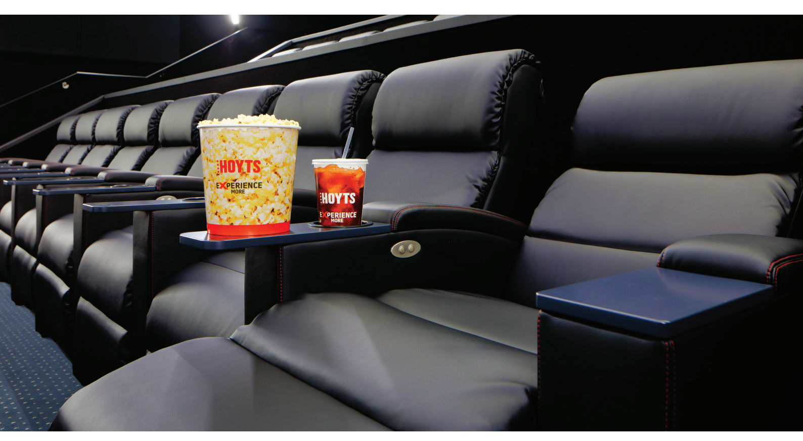
Cinema Recliners - HOYTS District Docklands

Caring is at the core of the HOYTS Group values. The HOYTS Group cares about its guests, and it cares about its people. The HOYTS Group also cares about those working within its supply chain who contribute to the prosperity of the HOYTS brand, and we want to make sure that they are cared for too. That is why the HOYTS Group is proud to be taking action to identify and minimise the risk of slavery-like practices in our supply chain as part of our compliance with the Modern Slavery Act 2018 (Cth).