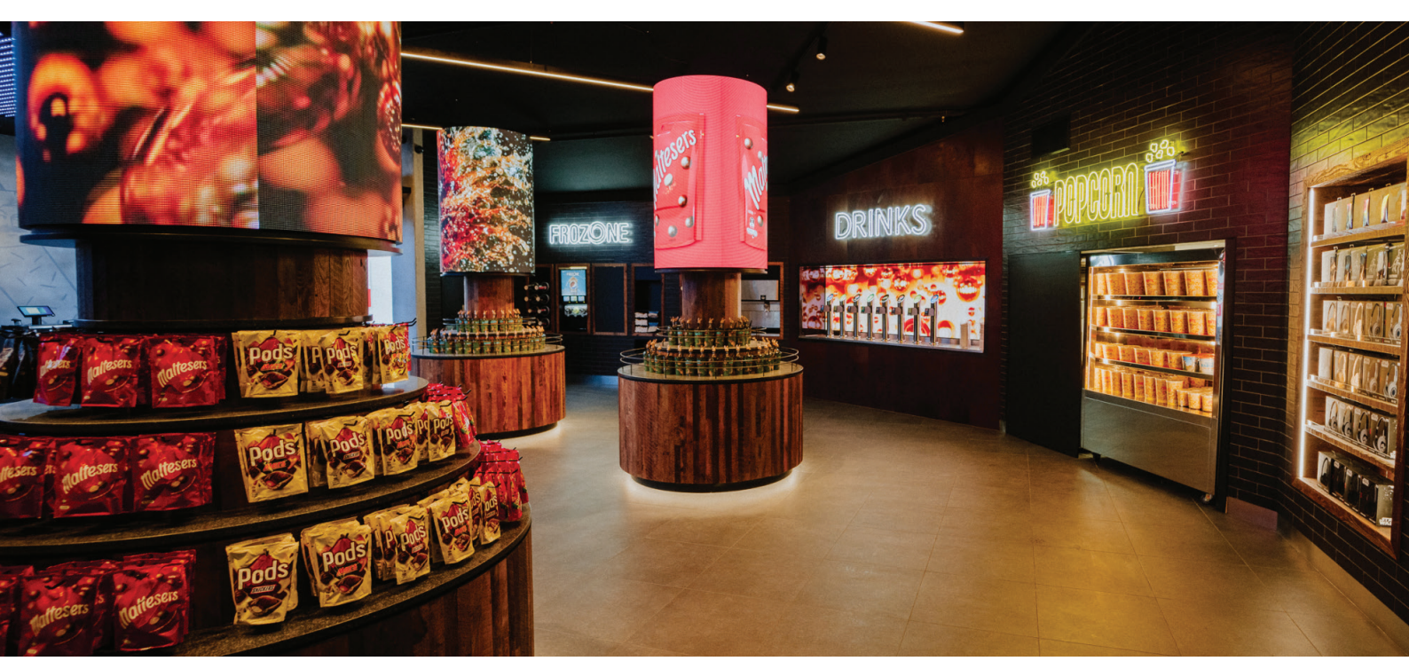
Treat City - HOYTS Ormiston

In addition to a commitment to fair and equitable treatment for all employees, the HOYTS Group leverages several technology solutions to ensure that rostering, attendance and payroll systems deliver accurate and timely payment of wages and entitlements to all employees.