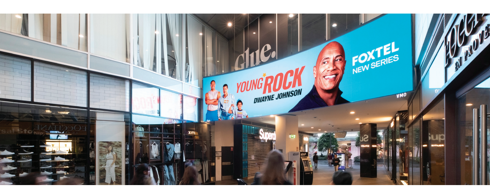
Val Morgan Outdoor digital screen - World Square