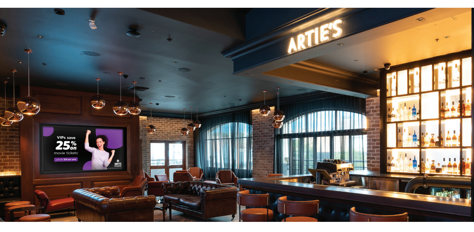
Artie's Bar - HOYTS Cronulla