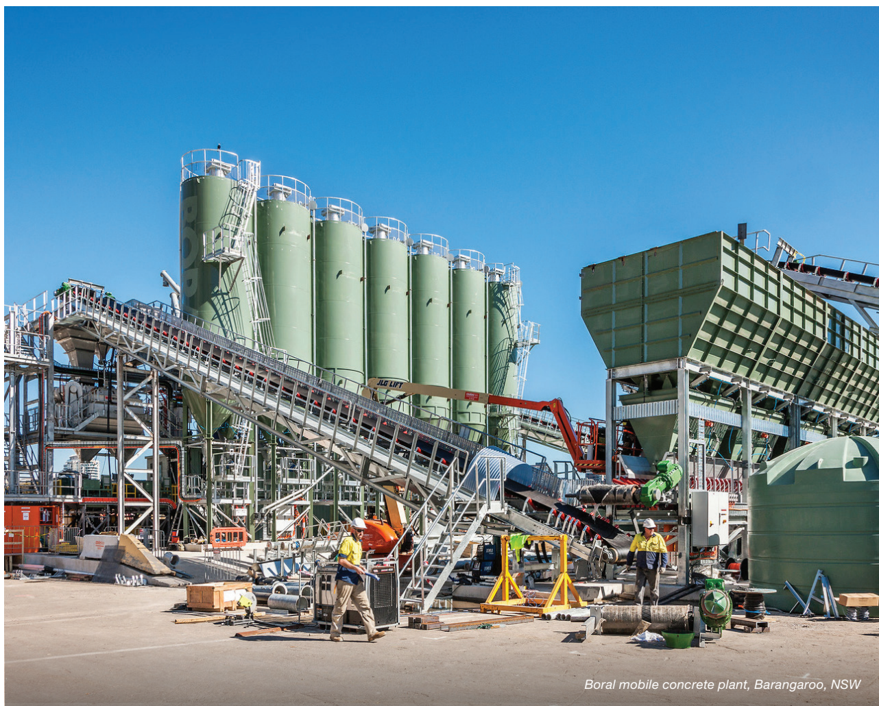
Boral mobile concrete plant, Barangaroo, NSW

This Joint Modern Slavery Statement (Statement) is made by Boral Limited (Boral) and USG Boral Building Products Pty Limited (USG Boral Australia) for the year ended 30 June 2020 (FY2020).