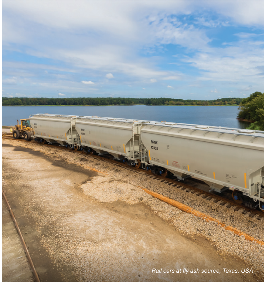
Rail cars at fly ash source, Texas, USA

Chaired by Boral's Group President, HSE, Sustainability, Innovation & Operations Excellence, the Working Group includes members of Boral's Executive Committee and senior representatives from Boral Group Human Resources, Procurement, Risk and Audit, Legal and Investor Relations as well as USG Boral Australia.