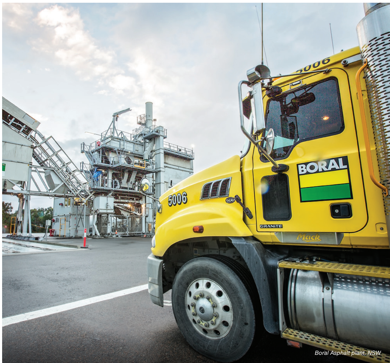
Boral Asphalt plant, NSW

Our Working Group will determine the most appropriate method, scope and resources for assessing the effectiveness of our approach and processes related to modern slavery risks.