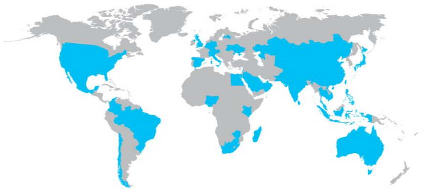
Figure 2: Our worldwide presence

Our annual report for the reporting year 2021-22 (i.e. period covering 1 April 2021 – 31 March 2022) can be accessed at https://www.nucleussoftware.com/investors .