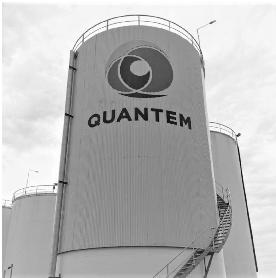
Above: Tanks at Devonport