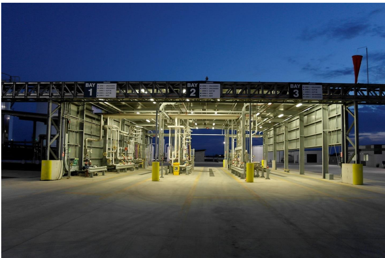
Above: Truck loading gantry at Pelican Point

This statement was approved by the Quantem Board on 3 March 2021.