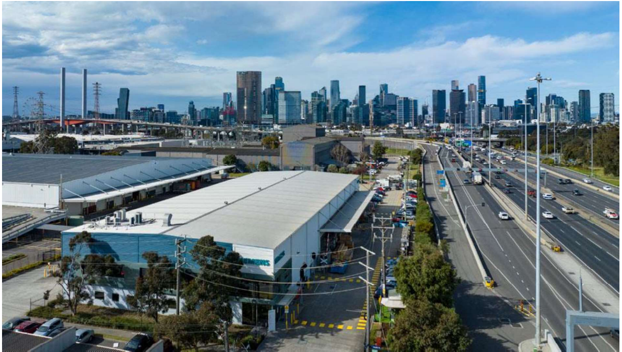
Figure 2 Siemens Mobility Manufacturing Facility in Port Melbourne, Victoria, Australia.